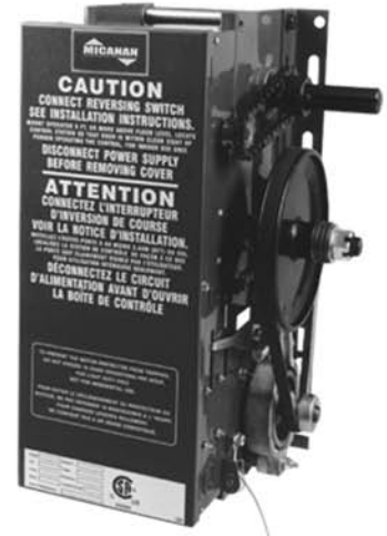
Commercial limited duty belt drive jackshaft operator